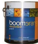
plastic paint cans