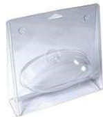
Moulded retail Packaging or non-medical blister pack (boxboard & paper removed)